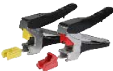
Exchangeable Jack Support Portion