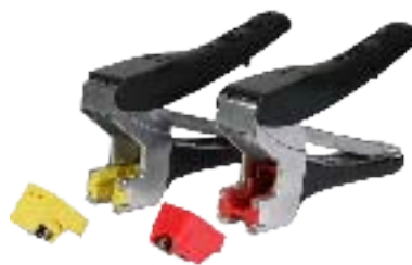
Exchangeable Cutting Module