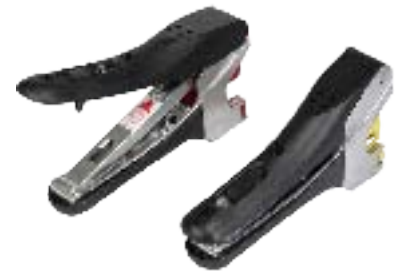
Locking Handle Design