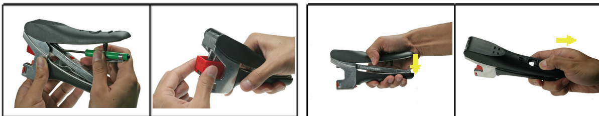
Exchangeable Cutting Module