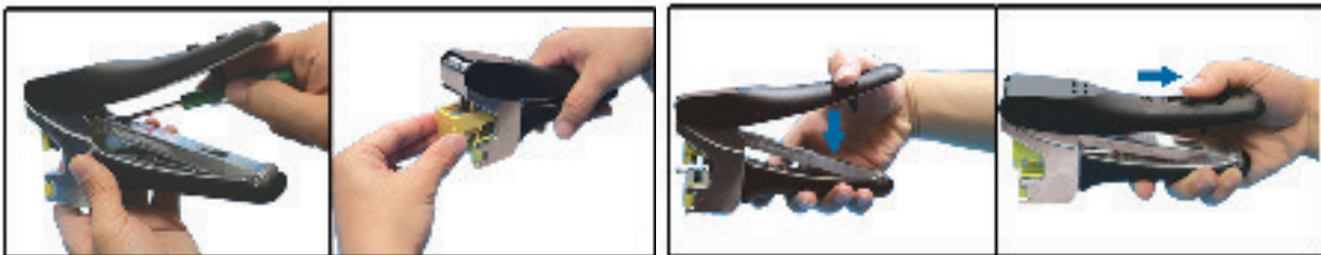
Exchangeable Cutting Module